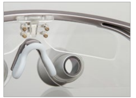
Dioptre balancing Optional clip for individual glasses for long and short distance correction for perfect overview.